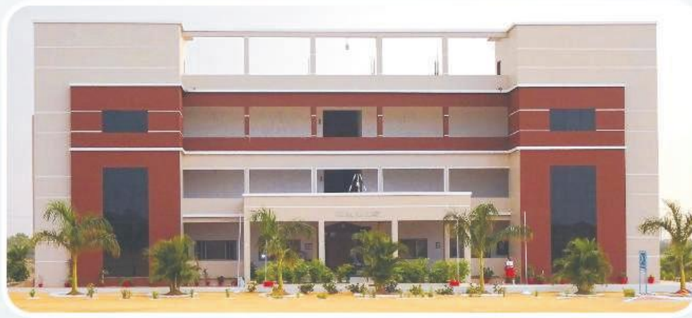
Salma Ali Block